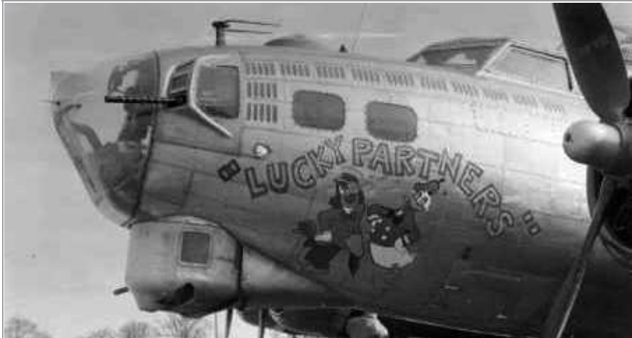
Photo between December 1944 and April 1945 Also named " Little Herbie ," scrapped at Kingman, Arizona in 1946. The fragment of nose bearing the nose art now hangs in the Mojave Museum in Kingman.