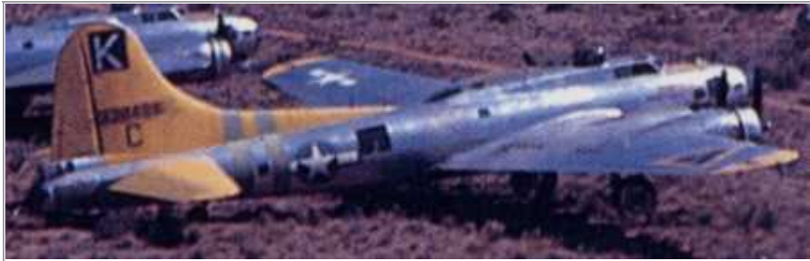
Photo taken at Kingman in 1946, carries the Triangle-K of the 379th Bomb Group on its wingtip.