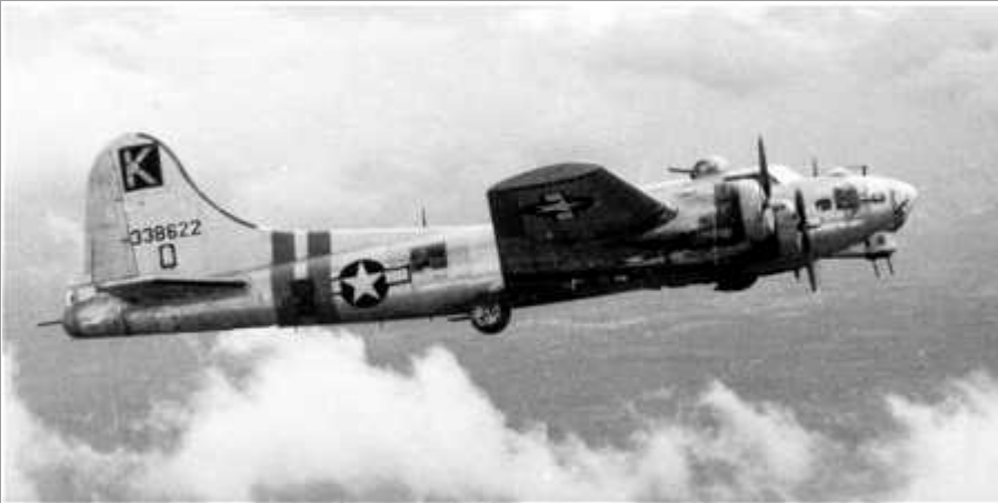
Photo between February and May, 1945 Scrapped at Kingman, Arizona in 1946.