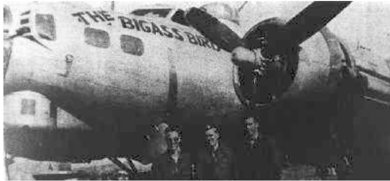
Photo undated, and personnel unidentified; identification of aircraft based on chronology and supporting documents;