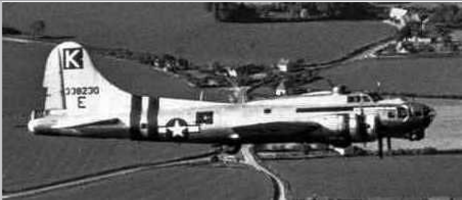
Scrapped at Kingman, Arizona in 1946.