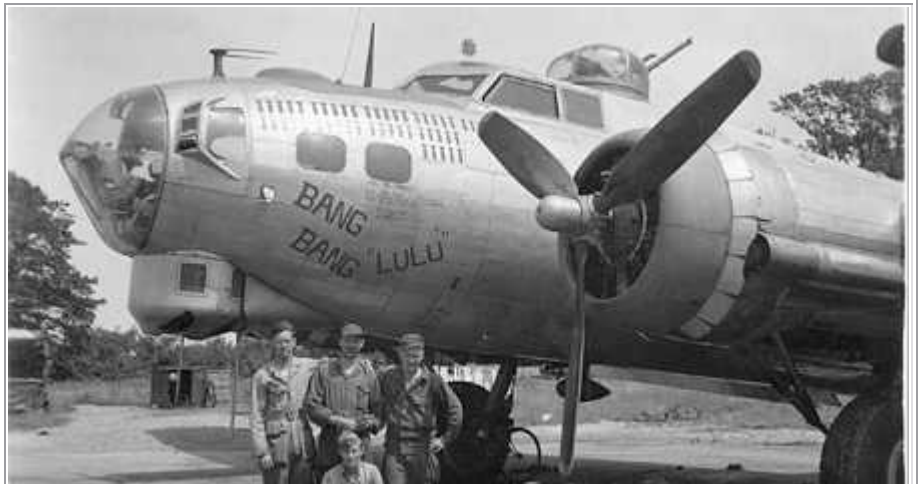
Photo between October 1944 and May 1945. Scrapped at Kingman, Arizona in 1946.