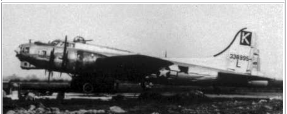
Photo dated Feb. 22, 1945 Damaged in the explosion and fire at Rattlesden on February 21, 1945; written off and salvaged.