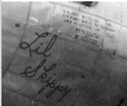
Photo between November '44 and February '45 Scrapped at Kingman, Arizona in 1946.