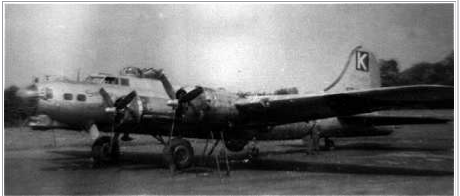
Photo between Sept. 1944 and February 1945 Scrapped at Kingman, Arizona in 1946