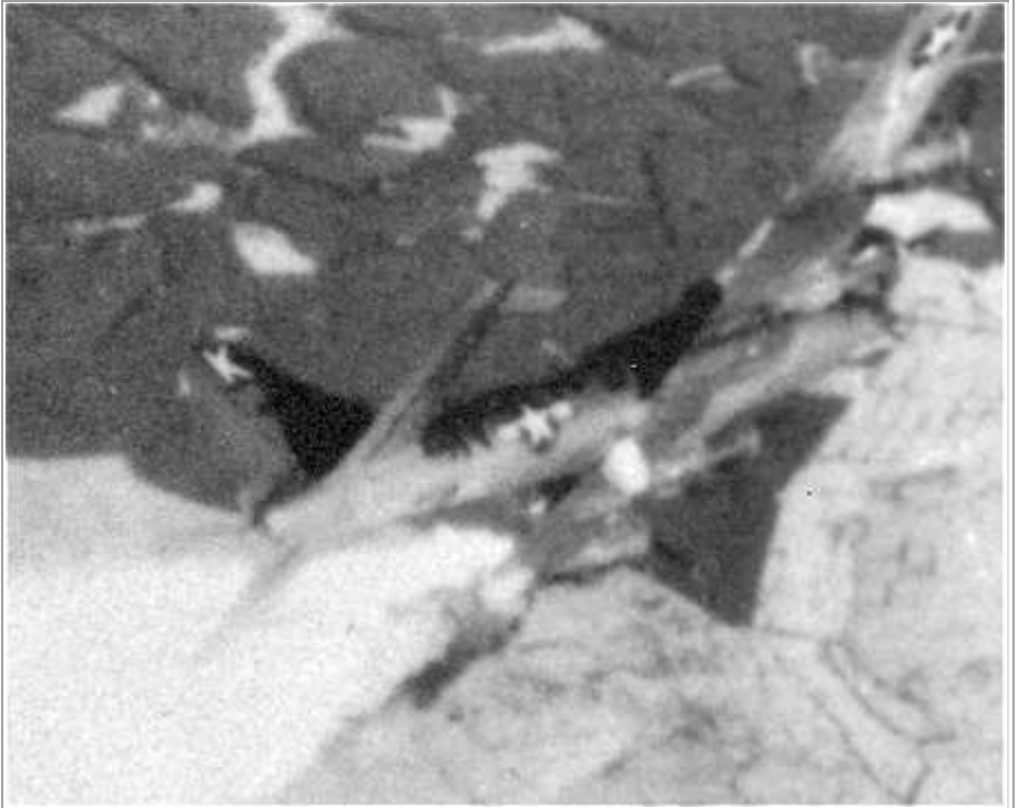
Photo date December 24, 1944 One of the most chilling photos in the collection, the Pathfinder 48355, piloted by Lt. Miles S. King, is seen falling from formation, left wing on fire. Only two members of the crew survived.