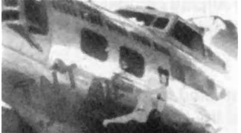
Photo Between Jun 1944 and March 1945, to be established by mission count (50).