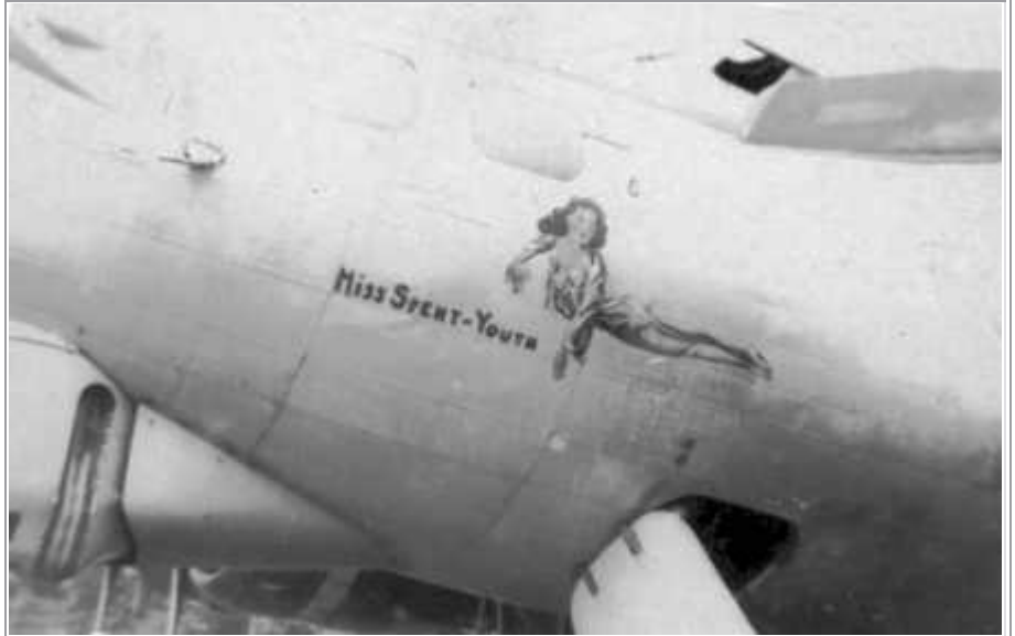
44-8131 Y (name unknown) PFF Photo dated Feb. 22, 1945 H2X pathfinder. Damaged in the explosion and fire at Rattlesden on February 21, 1945; written off and salvaged.