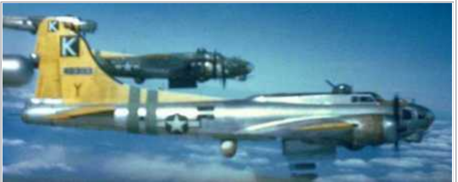
on April 8, 1945 H2X pathfinder, scrapped at Walnut Ridge, Arkansas in 1946.