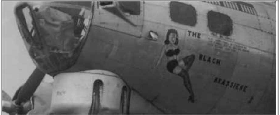
Photo after November 1944, to be established by mission count. Scrapped at Kingman, Arizona in 1946.