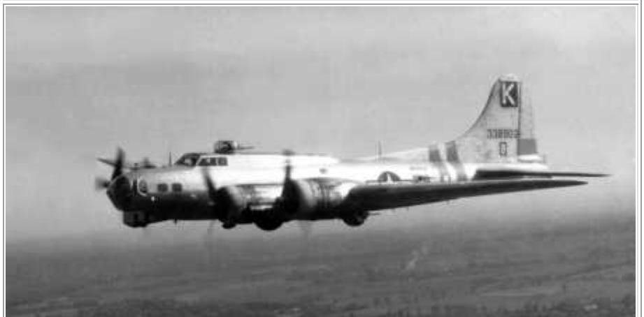
Photo between February and May, 1945, sometimes confused with Bit o' Lace (42-97976) of the 709th Squadron. Scrapped at Kingman, Arizona in 1946.